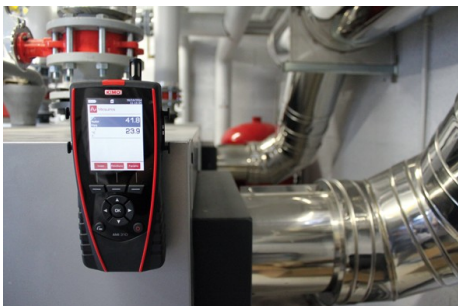
Climatic conditions measurement

AMI 310 SK: portable supplied with a ±500 Pa pressure module, a telescopic hotwire probe with gooseneck, a Ø6 mm Pitot tube, 2 x 1 m of silicone tube, a stainless steel tip